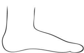
INSIDE OF FOOT