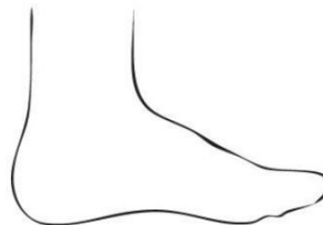
OUTSIDE OF FOOT