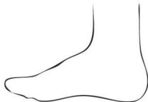
OUTSIDE OF FOOT