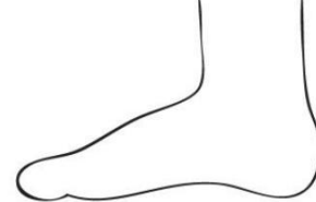
INSIDE OF FOOT