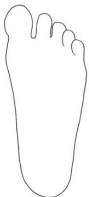
BOTTOM OF FOOT