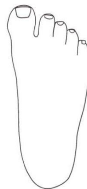
TOP OF FOOT